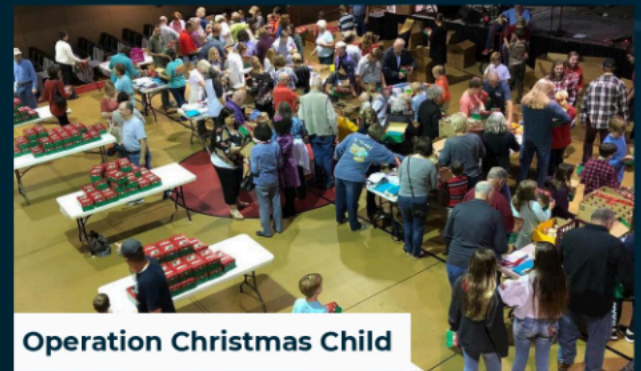
Operation Christmas Child