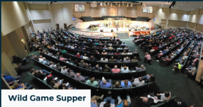
Wild Game Supper

We now have Sunday morning and Wednesday evening services. On Sunday mornings, we have a simultaneous contemporary service in the Family Life Center with a Praise Band and Traditional Service in the sanctuary with a choir and orchestra. We have D-Life classes on Sunday evenings. We have Bible Studies for all ages on Sunday mornings. We have Team Kids on Wednesday night for children, while the prayer meeting is in the sanctuary for adults. The youth meet on Wednesday night with Bible Study, prayer, games and food. We also have Women on Mission (or WMU) and Baptist Men. The Baptist Men sponsor a Wild Game Supper in March that draws at least 600 men, women and children. The Women's Ministry sponsors Fall and Spring Brunches, Bible studies twice a year, and an Arts and Crafts Ministry. The Prime Timers, the senior adult ministry, sponsors a monthly luncheon, day trips and overnight trips. Our Vacation Bible School, usually the first week in June, is a huge event involving over 250 volunteers and children. In June, our music minister leads a Music Camp. Our children's department sponsors an Easter Egg Hunt in the spring and a Trunk or Treat event in October.